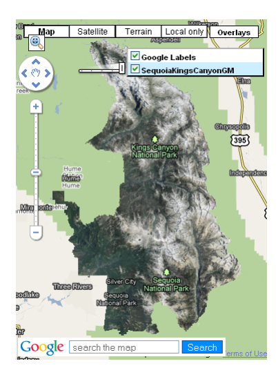
A Google Maps tileset with orthoimagery of Sequoia and Kings Canyon National Parks in California, USA (zoom level range 4 to 17). This tileset has problems with tile formats such as you might find in web tilesets created outside TNTmips.