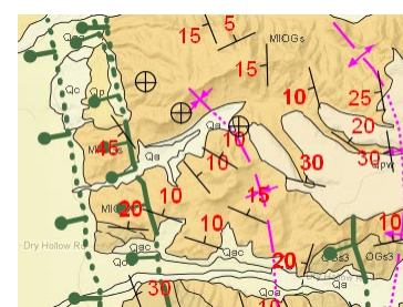
Geomashup of several SVG geometric tilesets with complex line and point symbols rendered from TNT CartoScripts.

TNTmips can create standard web (raster) tilesets suitable for use in geomashups designed for any popular geobrowser (Google Maps, Google Earth, Bing Maps, and Open Layers). In addition, Google Maps and Google Earth geomashups can also include simple KML files and KML geometric tilesets, and Google Maps geomashups can include SVG geometric tilesets. The Assemble Geomashup process is used to choose the custom overlays to use, the geobrowser base map(s), range of zoom levels, legend parameters, custom tools and controls, and other settings.