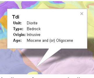
Attributes for geometric tileset polygons shown in the Google info window.

TNTmips can create two types of geometric web tileset: KML and SVG geometric tilesets. Both forms can be used to present map data with styled polygon, line, and point features with attributes for viewing on the web with other custom overlays and geobrowser base maps.